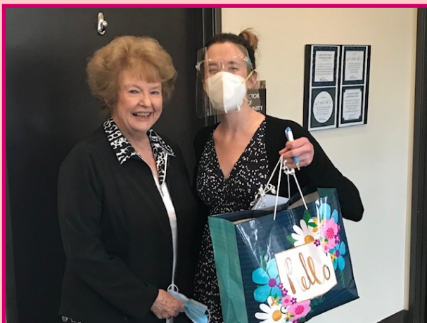
Cedar Point at Cottonwood