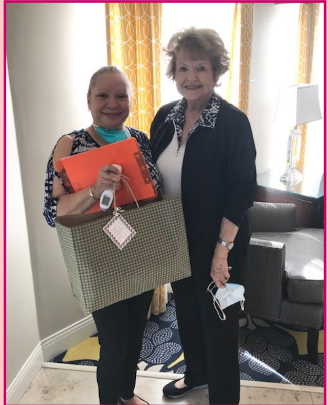
New Hope Manor