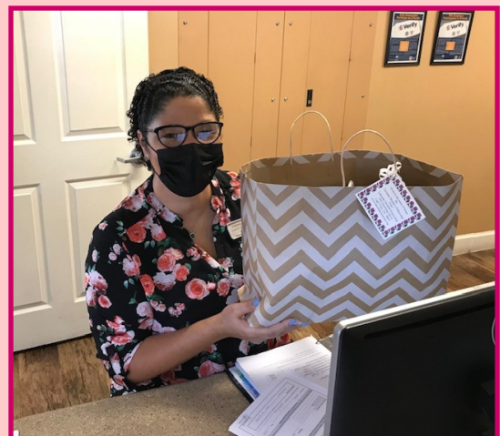
Isle of Cedar Park Alzheimer Unit