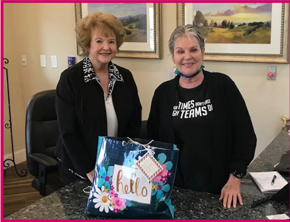
Auberge Memory Care